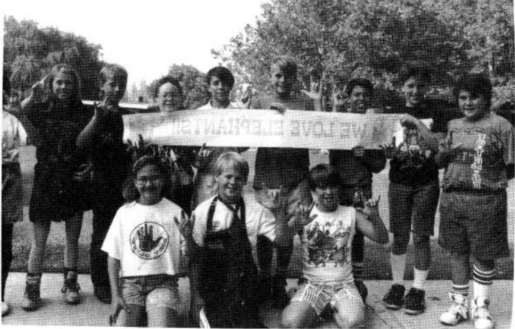
The California School for the Deaf has once again raised a contribution of $200.00 from bake sales. Many thanks to you.