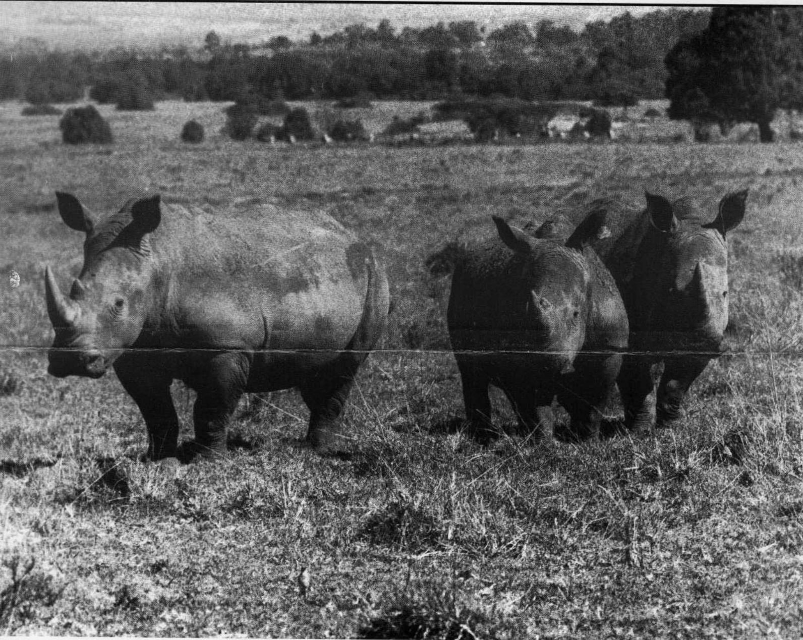
WHITE RHINO ARRIVE AT THE MT. KENYA GAME RANCH

P.O. Box 67981, Los Angeles, California 90067 • Tel. (213) 274-3169