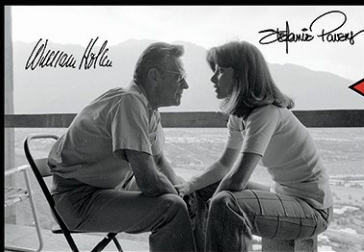
2018 CALENDAR WILLIAM HOLDEN WILDLIFE FOUNDATION